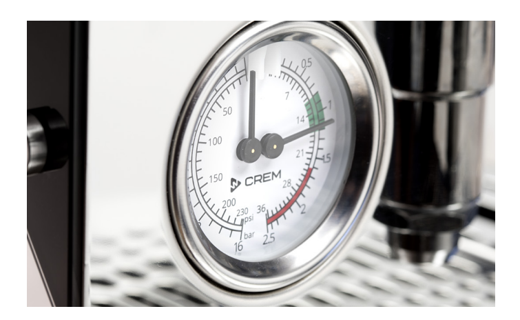
Double pressure gauge, high polish stainless steel