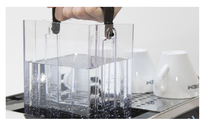
Water tank solution