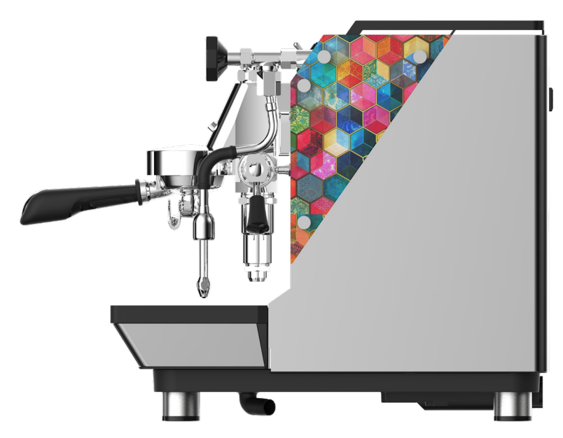
Customisable side panels*