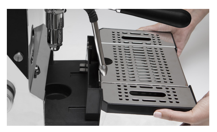
Smart drip tray