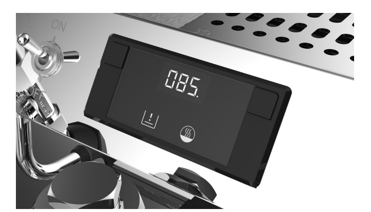
1B version display